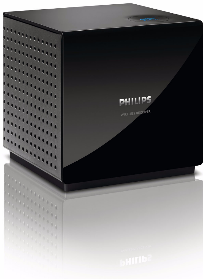
Philips Wireless Rear Audio module