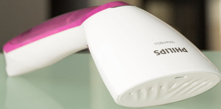
Philips Steam&Go Handheld garment steamer