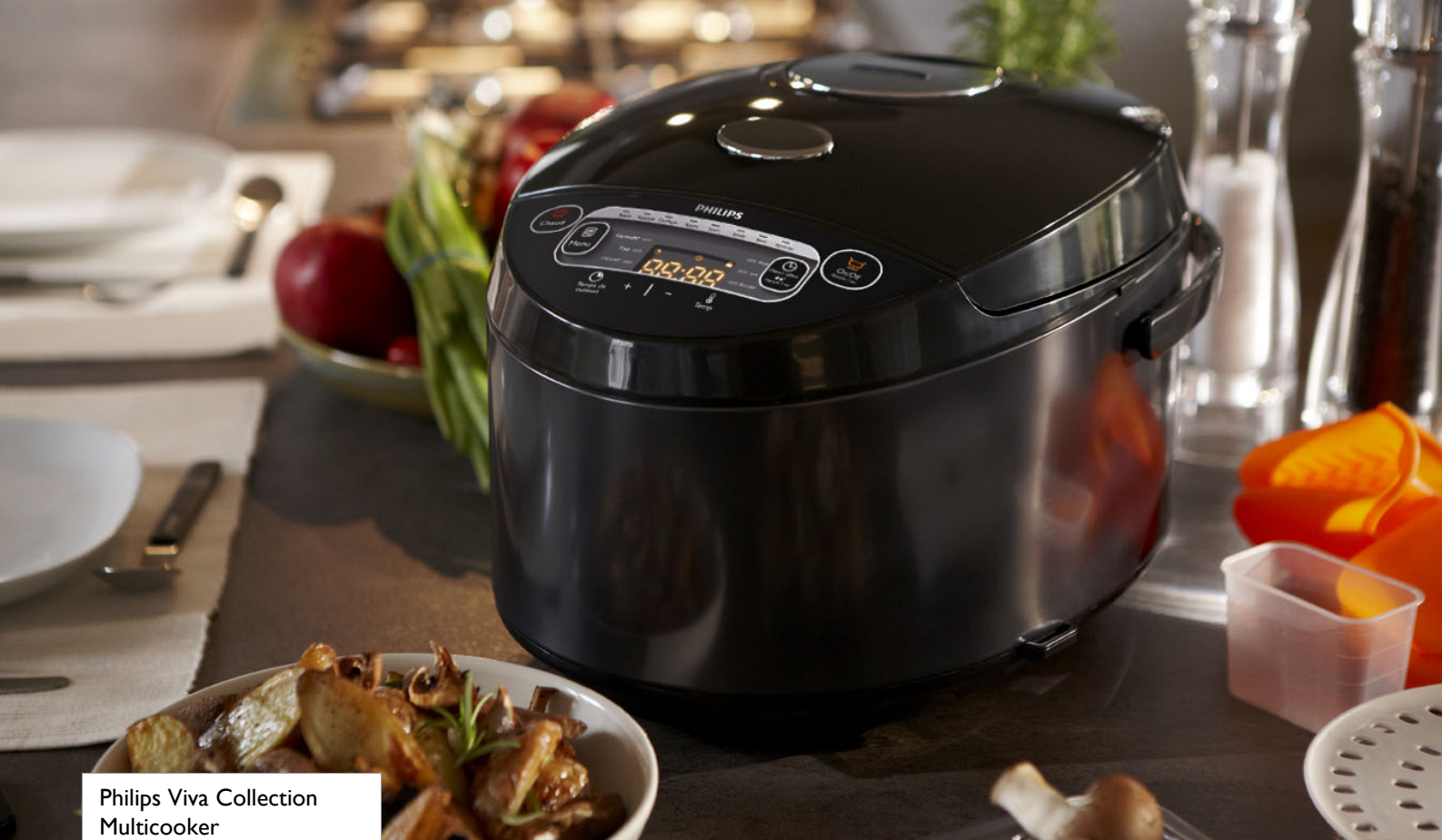
Philips Viva Collection Multicooker