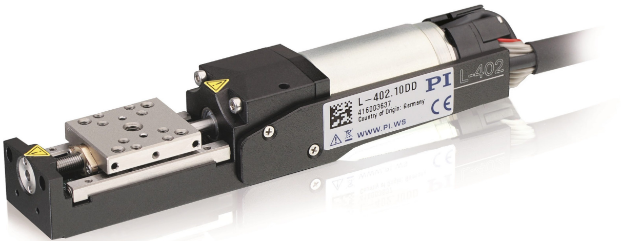
L-402.10DD with DC motor