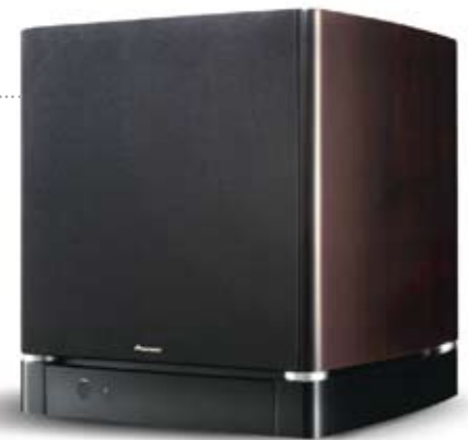
S-W1EX 12" Reference Standard Powered Subwoofer