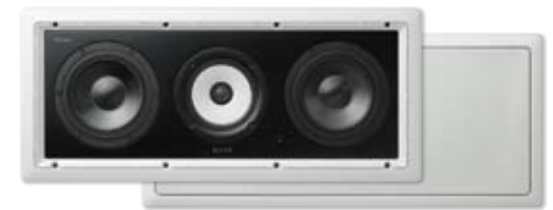
S-IW691L 6 1/2" Reference Standard In-Wall CST LCR Speaker