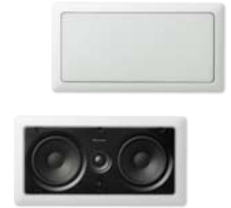
S-IW531L 5 1/4" In-Wall LCR Speaker