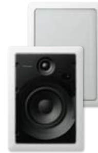
S-IW631-LR 6 1/2" In-Wall Speaker

These models offer a range of application solutions that challenge industry convention with benchmark entry-level performance and build quality, expanding the entertainment experience throughout the home.