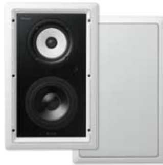
S-IW691 6 1/2" Reference Standard In-Wall CST Speaker

Based on the award-winning EX platform, Pioneer introduces a reference-class system that redefines the architectural speaker category. The Elite EX Series is specifically designed to deliver the most faithful reproduction in dedicated home cinema and two-channel systems for critical listeners who revel in pristine performances and ultimate fidelity.