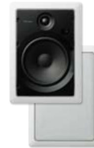
S-IW831-LR 8" In-Wall Speaker