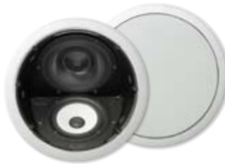
S-IC691A 6 1/2" Reference Standard In-Ceiling CST Speaker