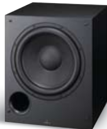
S-W601 12" Powered Subwoofer (Speaker grille included)