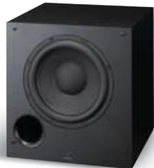
S-W501 10" Powered Subwoofer (Speaker grille included)