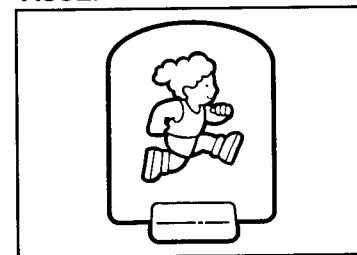
ASSEMBLED GAME PIECE