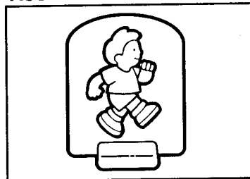
ASSEMBLED GAME PIECE