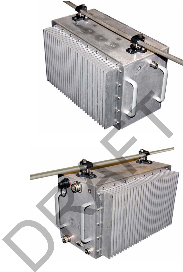
Figure 3-2 Nexus FT SM Cable Connections

Figure 3-6 illustrates the connections for the Nexus FT SM.