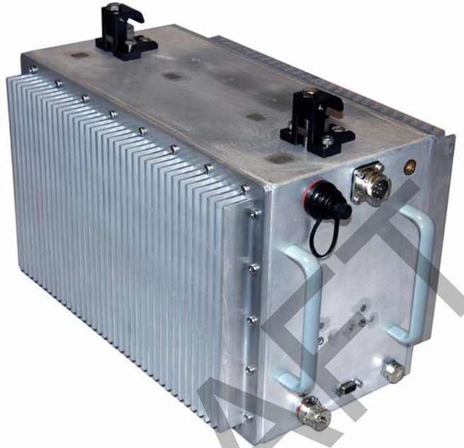
Figure 1-1 Nexus FT SM Repeater

The Nexus FT SM is housed in an aluminum enclosure, approved for outdoor use. The enclosure contains the repeater circuitry, with 2 hanger clips for positioning and securing the Nexus FT SM repeater along a cable.