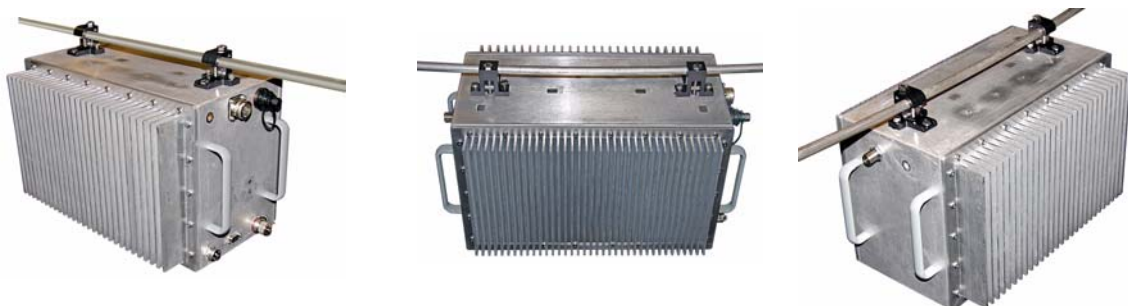
Figure 3-1 Cable Mounting

The Nexus FT SM is designed for mounting on a cable using the hangar clips attached to the top of the unit.