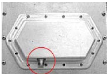
BSU Antenna Connection

You can use a short length jumper cable (such as ¼- to ½-inch coax or pigtail of approximately 6 feet in length) fitted with two N-type male connectors to connect the antenna port to the antenna (if the unit is located near the antenna) or to the primary transmission line (if the unit is mounted remotely from the antenna).