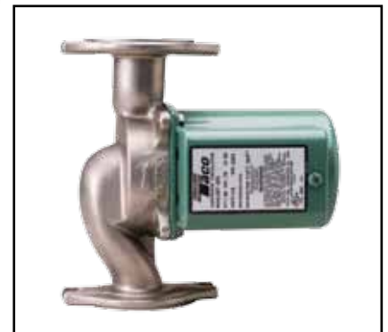
Stainless Steel Model