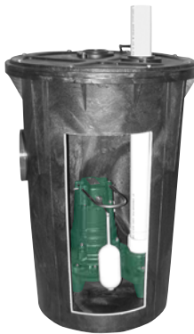
912-0063 Deluxe Basin (Top Discharge)