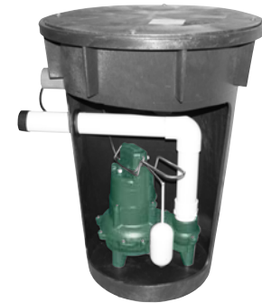
912-0082 (Side Discharge)