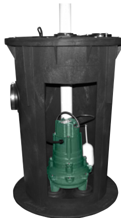
912-0088 Premium Basin (Top Discharge)