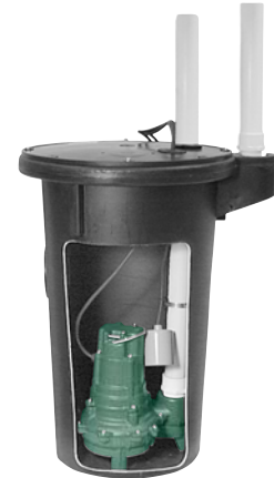
912-0056 (Top Discharge)