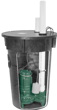
912-0017 (Top Discharge)