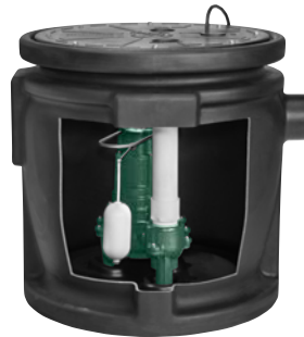
912-0116 Poly Molded Basin (Top Discharge)