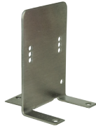
Liquid Smart® Floor Mount