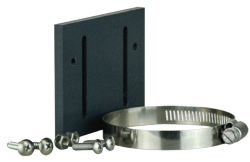
Grey Bracket Assembly