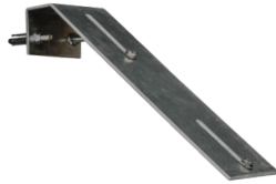
Solar Panel Mounting Kit