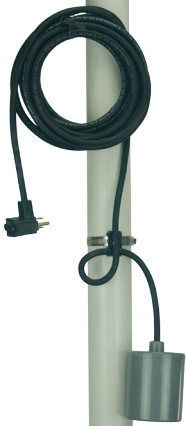
Normally Open Wide Angle Piggyback Float