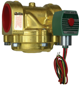
Solenoid Valve, 120VAC