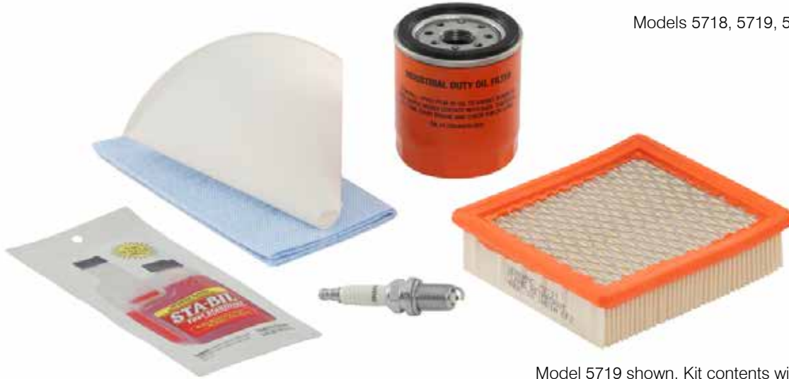
Model 5719 shown. Kit contents will vary by model.