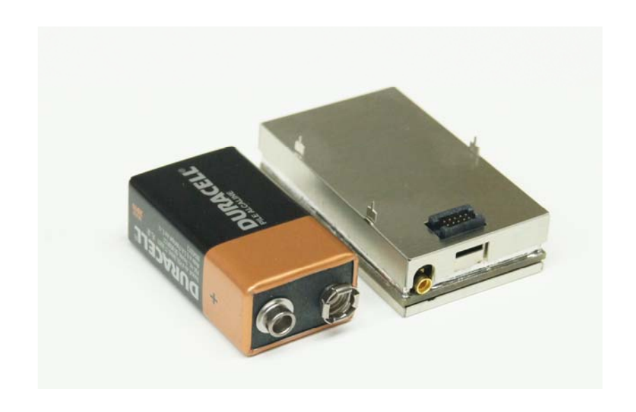
MCDR Multi-Channel Data Receiver P/N 10D1068-L, M, H

All rights reserved. No part of this book may be reproduced or utilized in any form or by any means, electronic or mechanical, without the prior written permission of Qual-Tron, Inc.