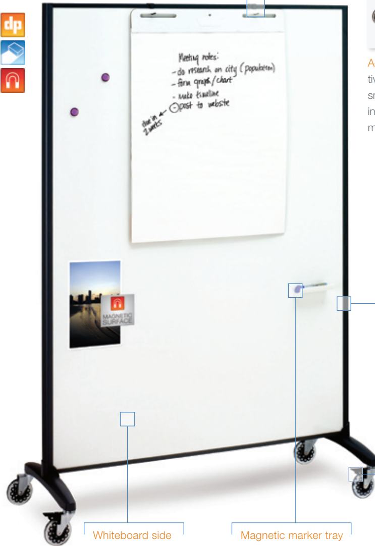
Repositionable flipchart pad holders