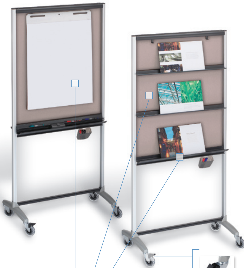
Two secure locking casters

Increased Communication. A double-sided board, the exceptionally designed Total Erase® surface evades stains and ghosting while the handy flipchart pad holder allows you to instantly communicate important messages.