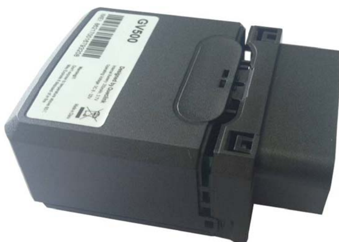
Figure 3. Opening the Case