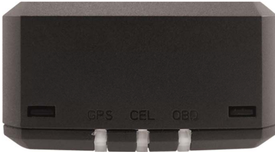
Figure 6. GV500 LED on the Case