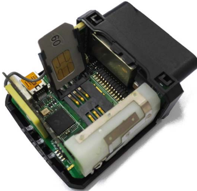
Figure 4. SIM Card Installation

Open the case and ensure the unit is not powered. Slide the holder right to open the SIM card. Insert the SIM card into the holder as shown below with the gold-colored contact area facing down taking care to align the cut mark. Close the SIM card holder. Close the case.