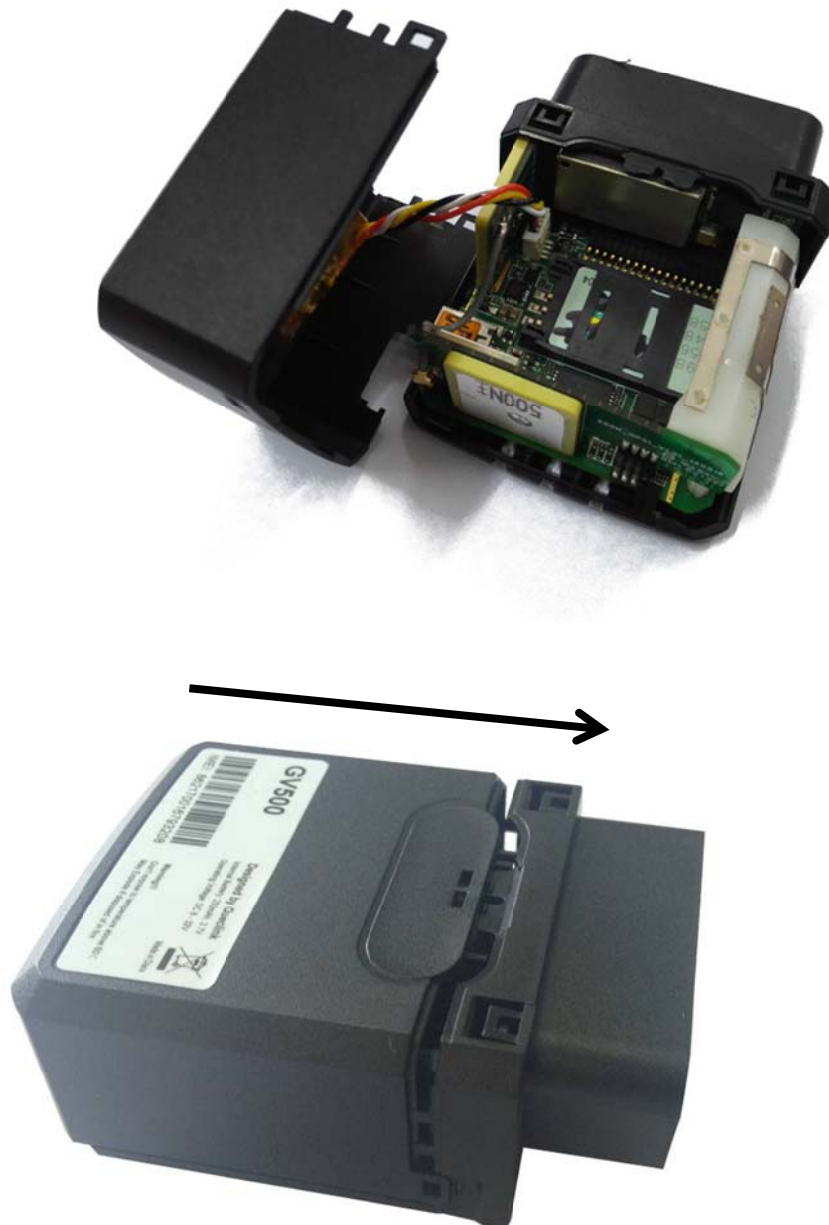
Closing the Case

The battery is glued to top cover, so before closing the case you should let the battery connector plugged in. The step of closing case is shown as following: