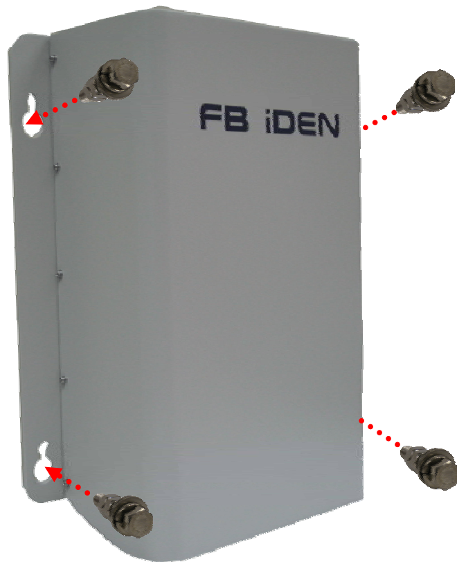
Figure 11. Mounting

iDEN Add-On Filter Box is easy to mount using the assembled mounting bracket, which has \varnothing 9 holes for the provided 5/16" fixing screws.