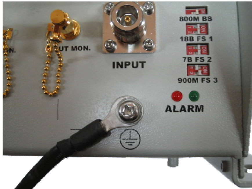
Figure 12. Grounding