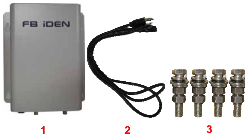
Figure 10. Items