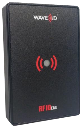
RF IDEAS pcProx® Plus SP Reader