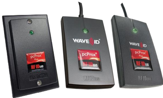
RF IDEAS pcProx® and pcProx® Plus Readers