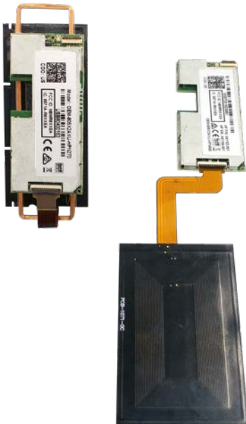
RF IDEAS pcProx® and pcProx® Plus Readers