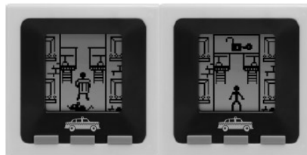
Jump the Rat Unlock Animations

CONNECT – BUILD A WORLD by CONNECTING other smaller or larger cubes to any side of the cube's magnets.