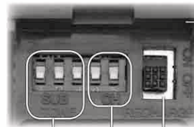
SUB TONE CH RECHARGE ON/OFF