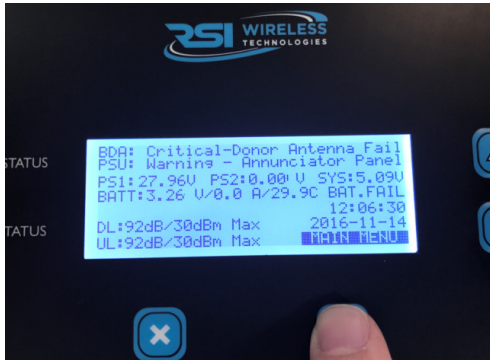
Figure 2 – System Status