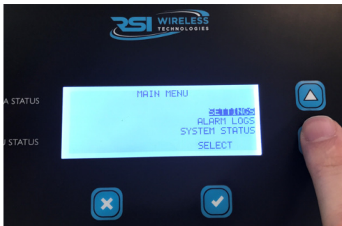
Figure 3 – Main Menu