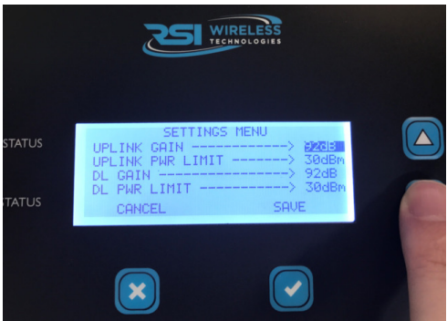
Figure 4 – Settings Menu