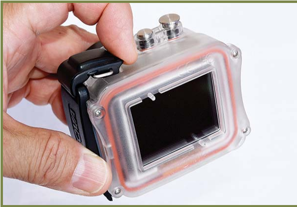
1. OPEN THE HOUSING DOOR