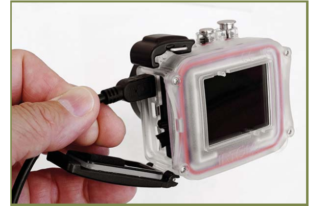
3. CHARGE BATTERY