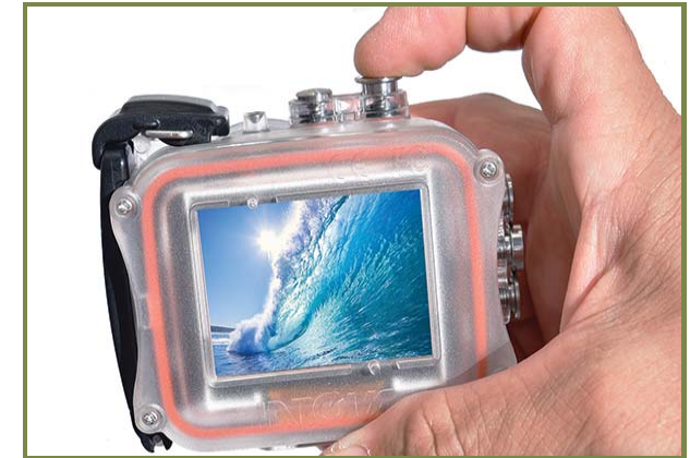
6. PRESS SHUTTER TO SHOOT/RECORD