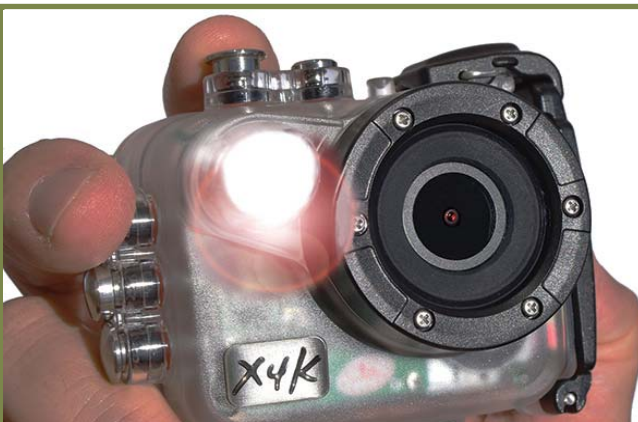
7. VIDEO LIGHT OR FLASH

* To activate LED video light: in video mode press and hold shutter button for 2 seconds until light bulb icon appears.