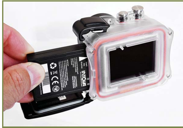
2. INSERT LI-ION BATTERY