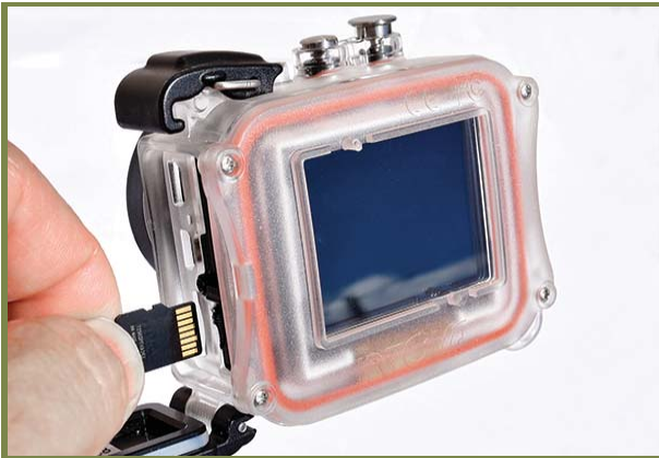
4. INSERT MICRO SD CARD