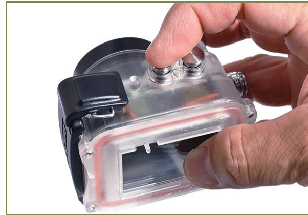
5. POWER ON (press and hold 2 seconds)