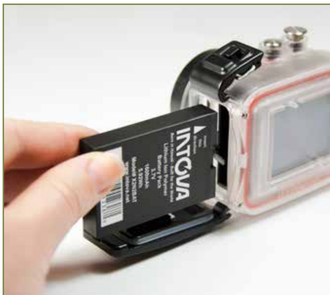
2. INSERT BATTERY