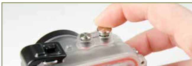
6. PRESS SHUTTER TO SHOOT/RECORD