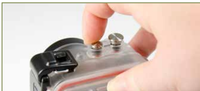
5. POWER ON (press & hold)