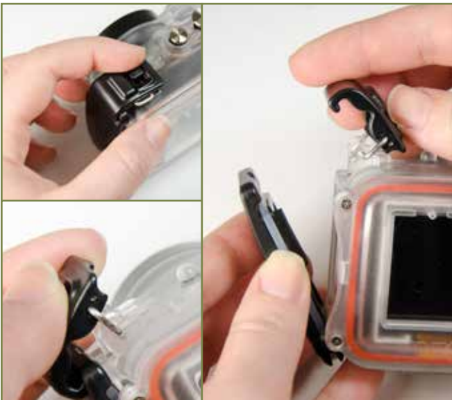
1. OPEN HOUSING DOOR

For complete instructions go to www.intova.com .