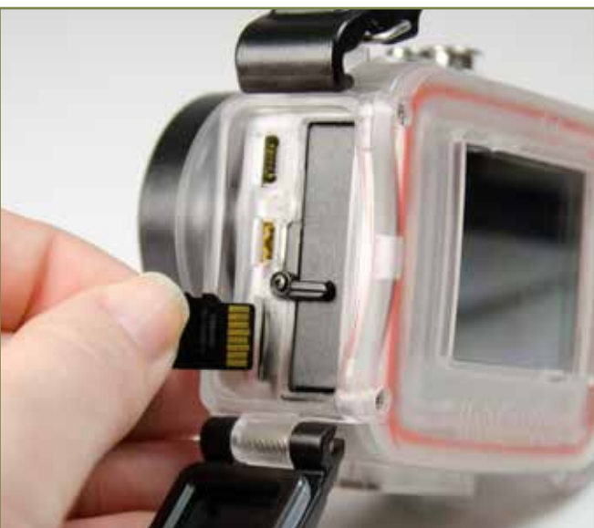
4. INSERT MICRO SD CARD