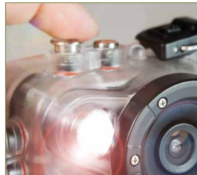
PRESS SHUTTER (press & hold) FOR LIGHT