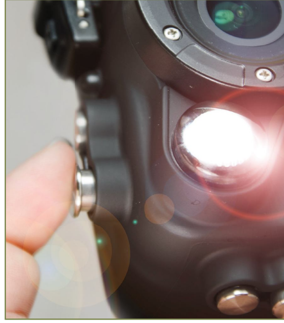
PRESS SHUTTER (press & hold) FOR LIGHT