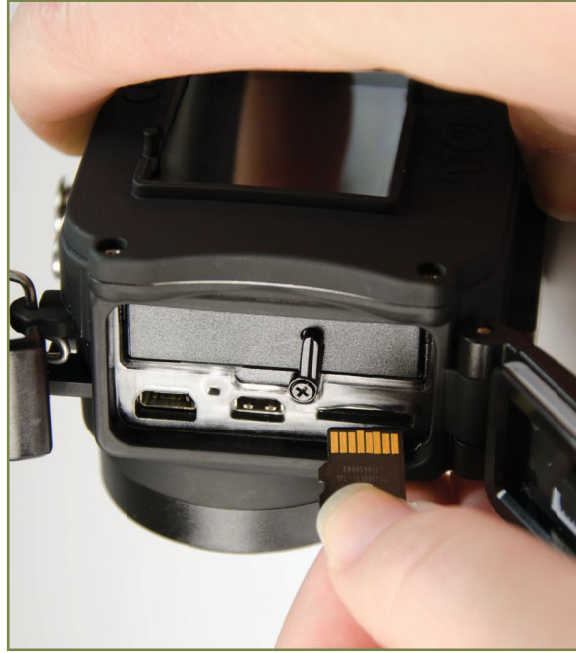
4. INSERT MICRO SD CARD (Up to 64GB class 10 microSD card)