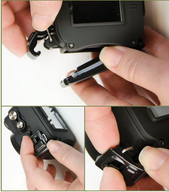
1. OPEN HOUSING DOOR

For complete instructions go to www.intova.com .