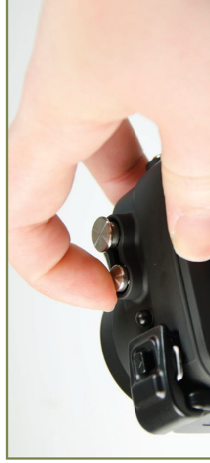
5. POWER ON (PRESS & HOLD)