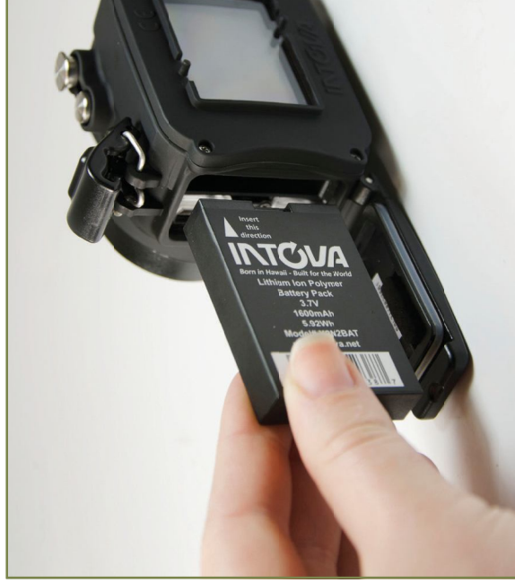
2. INSERT BATTERY