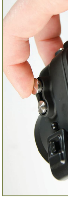
6. PRESS SHUTTER TO SHOOT/RECORD