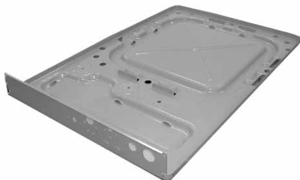
Drawn Painted Base Pan.