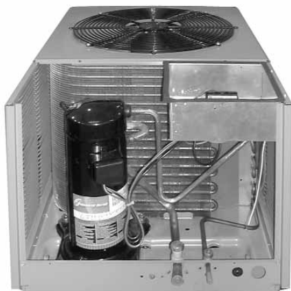
All controls and compressor are accessible for servicing by removal of the service panel.