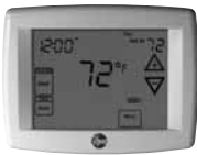
300-Series * Deluxe Programmable