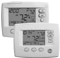
200-Series * Programmable