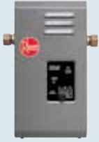
RTE 3 RTE 7