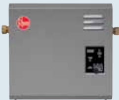
RTE 18 RTE 27