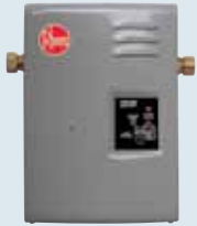
RTE 9 RTE 13