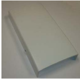
Figure 1: Top view