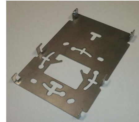
Figure 3: Mounting bracket