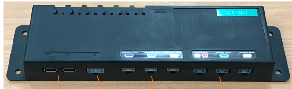
USB outlet LED Light bar Massage: Head; Foot & Extra Port Actuator: Head; Foot & Lumbar Port

The user should not modify or change this equipment without written approval from Ruoyey Lung Enterprise Corp. Modification could void authority to use this equipment.