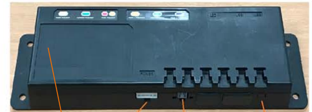
DC Power Input UART port Learn Button