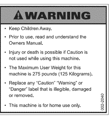
Label 1: General safety warning label.

Location: Affixed to the console mast cover just below the computer.