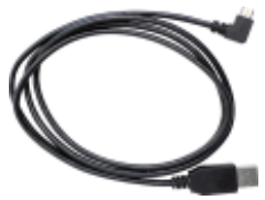
USB Power & Data Cable