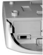
Main power switch

Turning on during installation Turn on the main power switch when the power supply cable is connected. The power indicator lights up and the device is turned on.