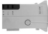
Secondary power supply switch

Turning on during installation Turn on the main power switch when the power supply cable is connected. The power indicator lights up and the device is turned on.