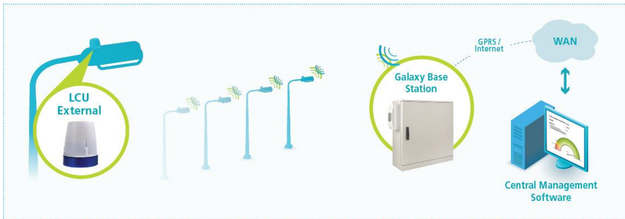
Figure 2 – System Topology

LCU NEMA is a luminaire control unit, easily installed on top of the luminaire utilizing a standard (twist and lock) NEMA socket. LCU NEMA is a unit of the T-Light Galaxy star network. Control features offer On/Off and dimming level operations. Monitoring features include identification of lamp and measurement of electrical parameters. The LCU NEMA is controlled by the Smart Lighting System Control Management Software (CMS) via a Data Communication Unit (DCU) gateway.