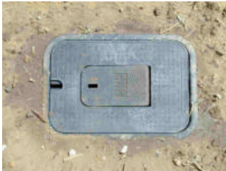
Plastic Pit w. plastic cover and metal lid