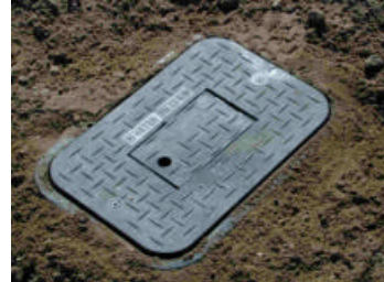
Plastic Pit w. plastic cover and plastic lid