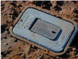
Plastic Pit w. concrete cover and metal lid