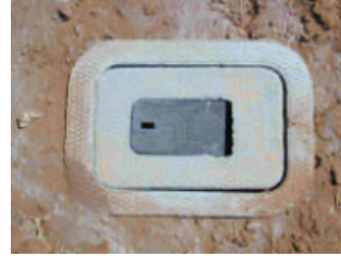
Concrete Pit w. concrete cover and metal lid