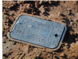
Plastic Pit w. plastic cover and no lid