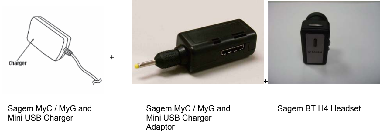
Sagem MyC / MyG and Mini USB Charger