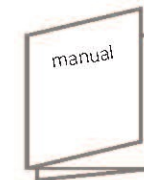
manual of instrucion