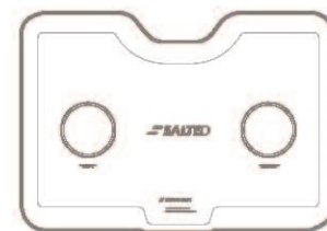
wireless charging pad