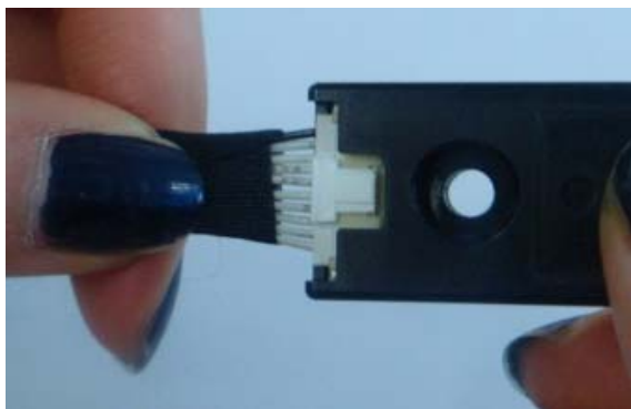
Figure 1-1) CABLE Connecting