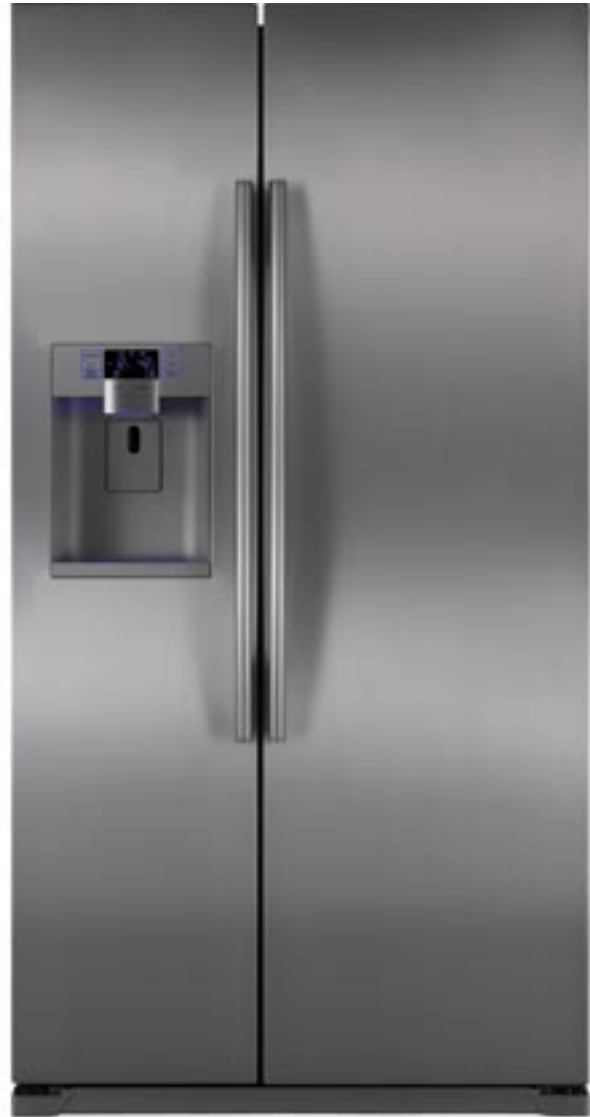
(Stainless Steel model shown)

Counter depth convenience in the same footprint! Samsung's innovative technology offers 25 cu. ft. of capacity and the ultimate in food preservation with Twin Cooling Plus®.