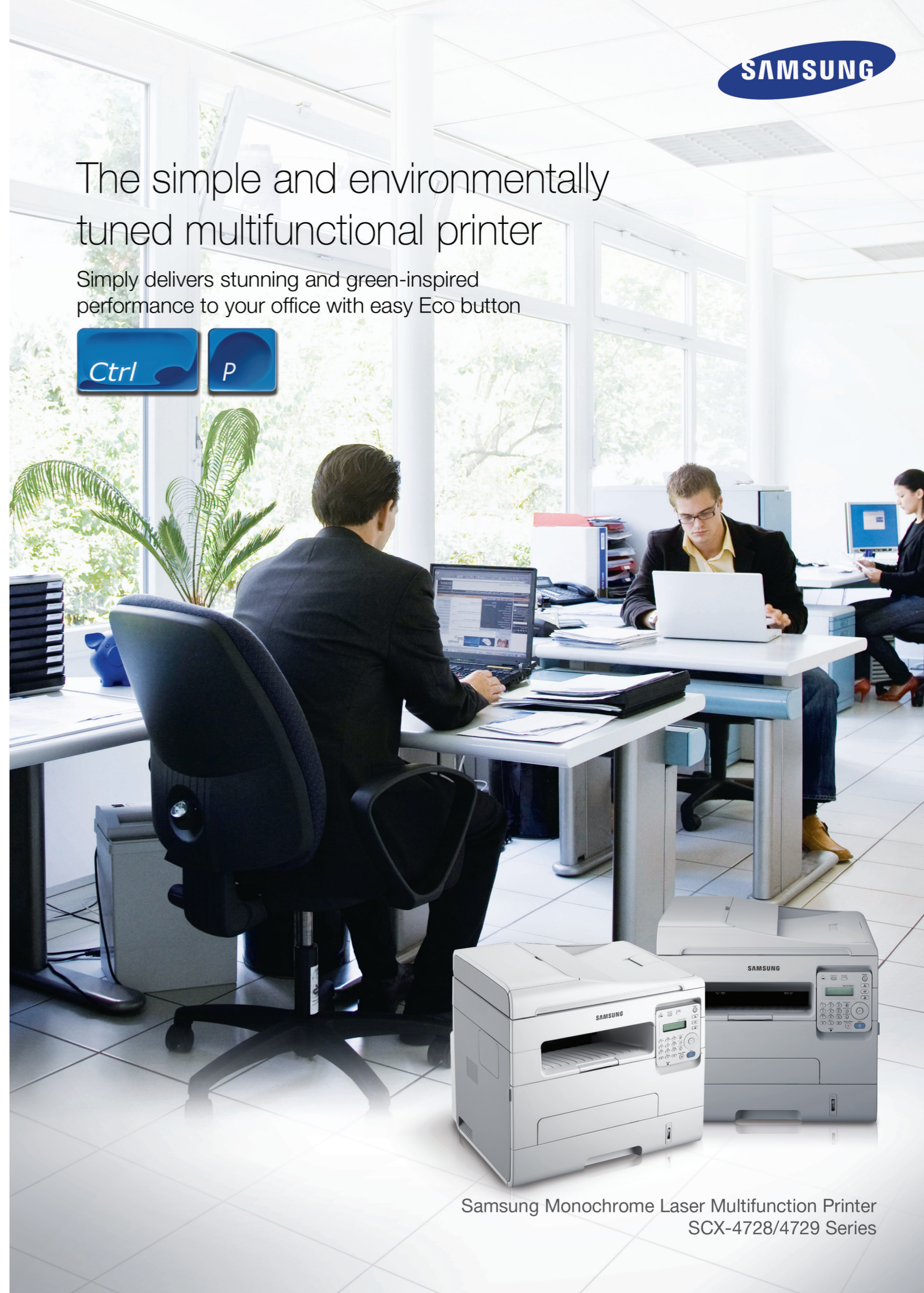
Samsung Monochrome Laser Multifunction Printer SCX-4728/4729 Series