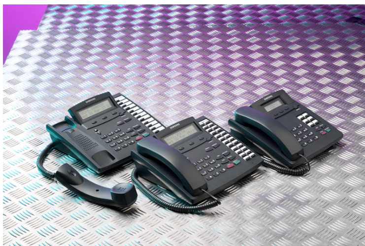
DCS Euro Display Keysets

The right-hand soft key is designated as the RIGHT soft key. This key is used to save any changed data while programming, or to move the cursor to the right on the LCD.