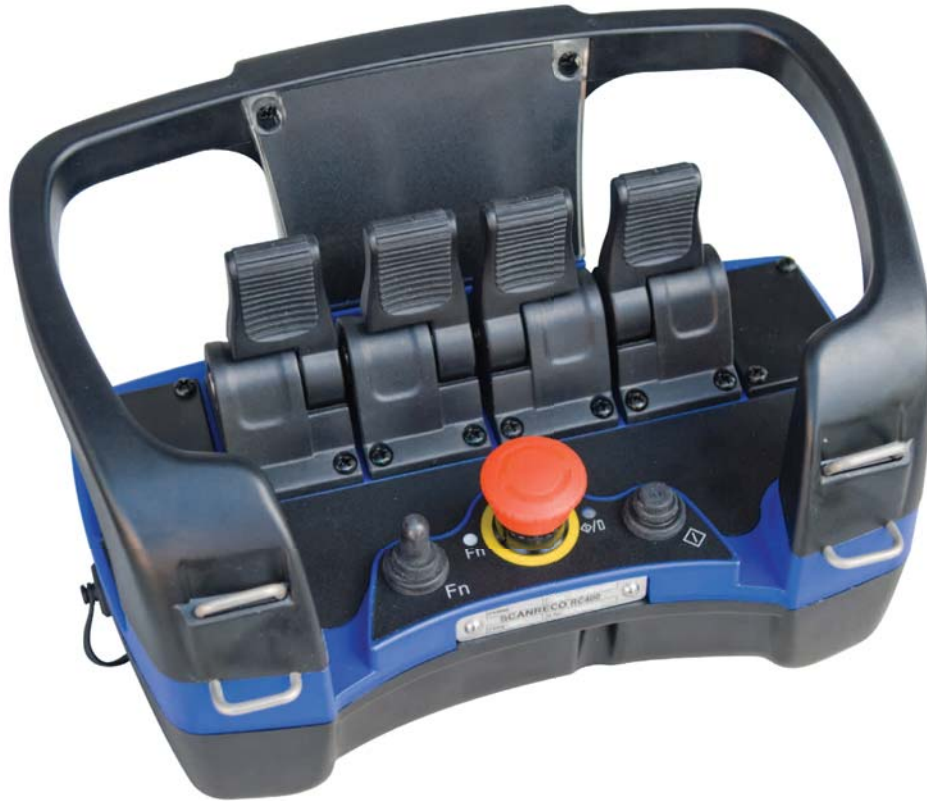
Figure 3.2 The Portable Control Unit.

The Portable Control Unit is impact, weather resistant, light weight and compact.