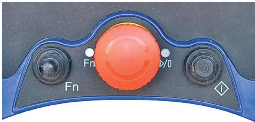
Figure 3.3 View of a stop function panel.

All movement of the crane is stopped if the stop function is activated on the control unit. The red LED indicates operating and battery status.