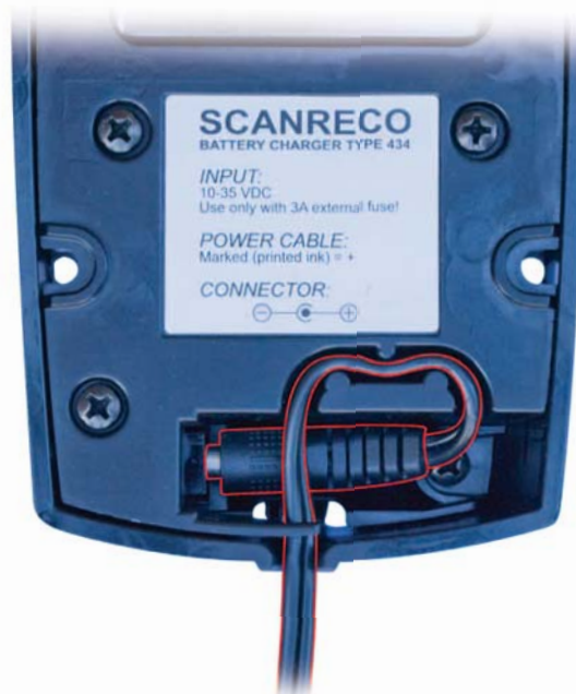
Figure 3.6 After connecting the cable connector, put the cable inside the cable track.