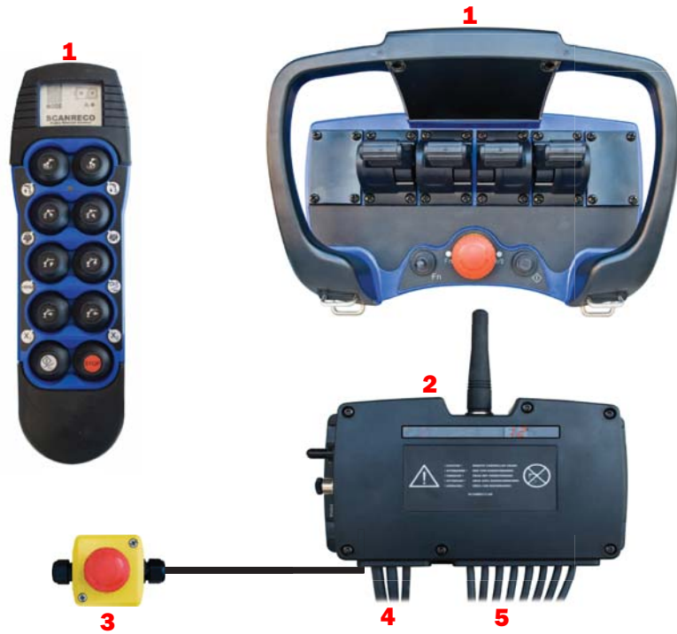
Figure 3.1 Schematic overview of the Scanreco RC-400 G4.

The Remote Control System is comprised of the following components (see figure 3.1):