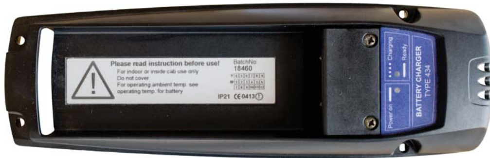
Figure 3.5 The battery charger.

The battery charger is using two different modes of charging. Initially the unit will charge with a high current until the battery is charged, then it reduces to a trickle charge mode until battery is removed. The normal charging time for an empty battery is approximately 3 hours. The battery charger is designed not to damage the battery even with long continuous charging (see figure 3.12).