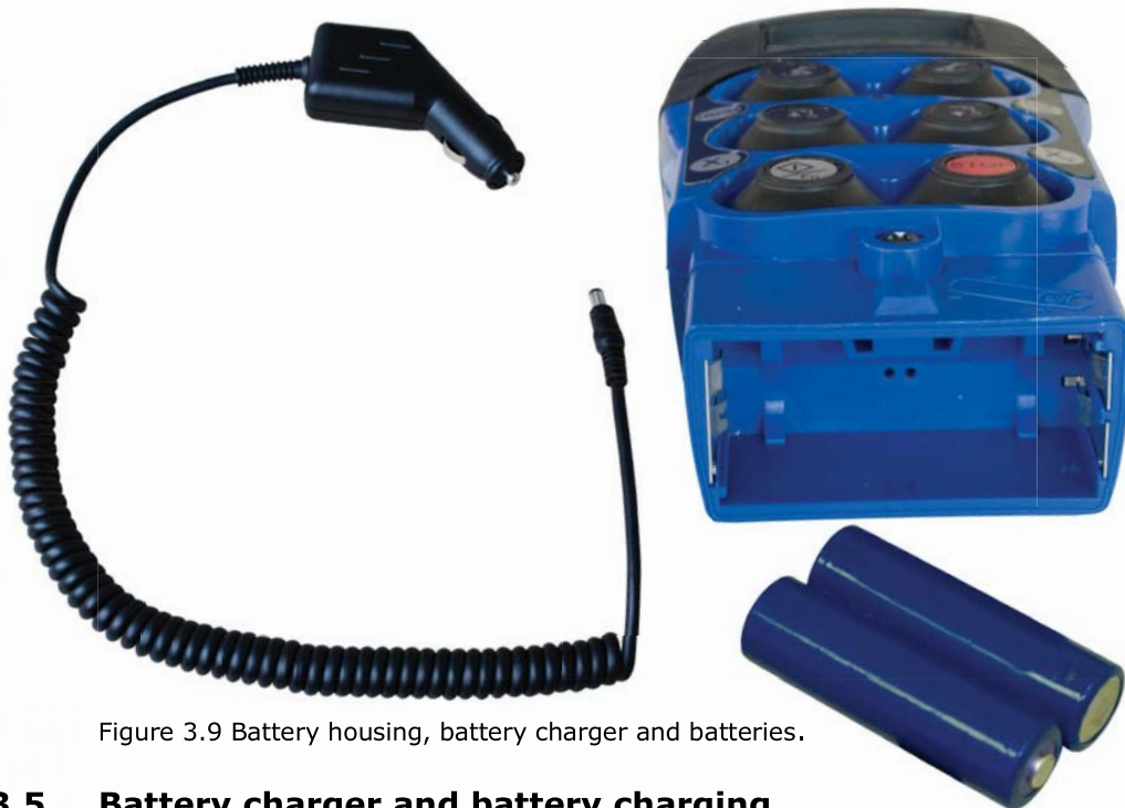
Figure 3.9 Battery housing, battery charger and batteries.

If operation is required; recharge batteries, replace batteries or connect the battery charger in order to allow further operation. The batteries are rechargeable via standard +12/24 VDC cigarette lighter charger or optional 110/220 VAC- charger.