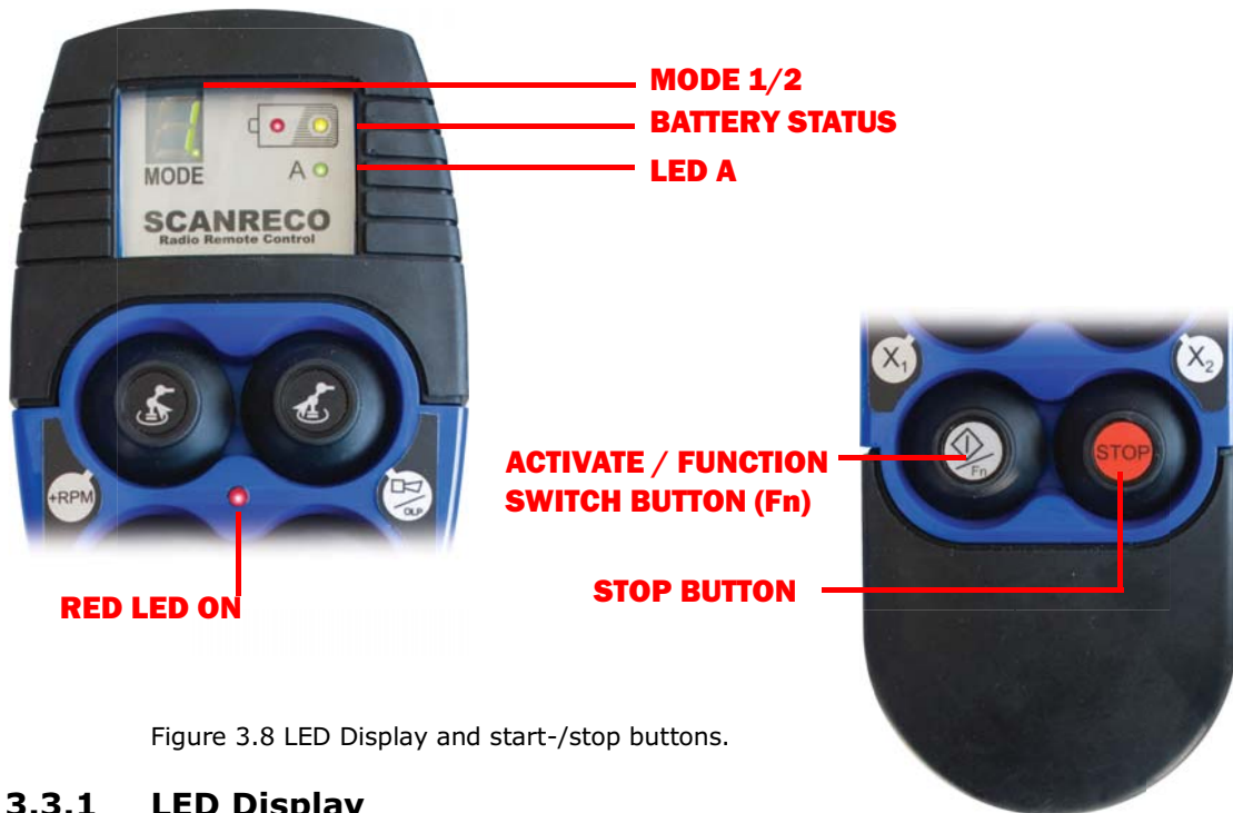
Figure 3.8 LED Display and start-/stop buttons.