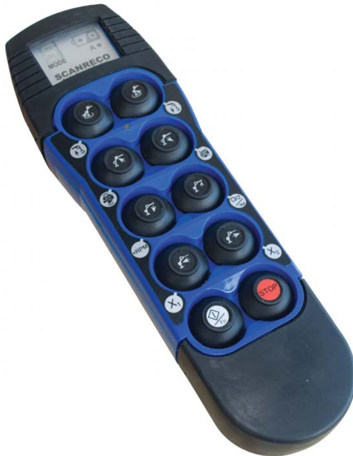
Figure 3.7 The Portable Control Units Handy.

The innovative push buttons which operate with stepless infinitely variable (proportional) speed - remains in direct proportion to the push buttons displacement for maximum precision and performance of the crane/machine. Up to four proportional functions can be controlled simultaneously (Handy-10). This stepless infinitely variable speed is facilitated by an innovative unique push button technology design principle. The Handy series has large distinct push buttons and can be used wearing working gloves, and the units are in are robust, light-weight, innovative, user-friendly and functional design.