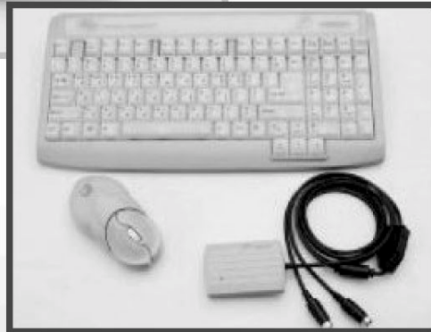
WS - 200