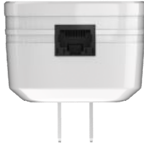
Figure 2: Side Panel