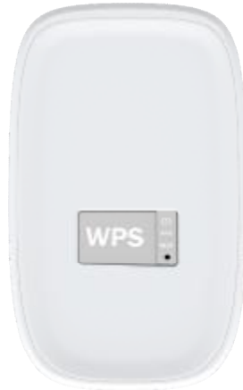
Figure 1: Front Panel