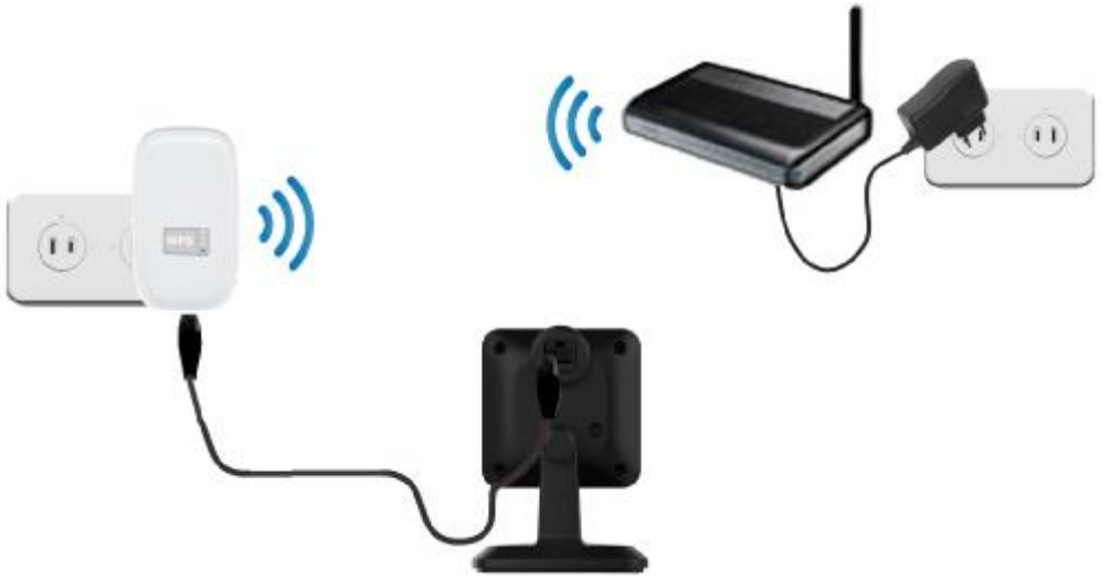
Figure 4: Installation