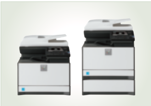
Expandable paper capacity stores up to 800 sheets.