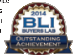
Outstanding Achievement In Innovation Cloud Portal Office

Cloud Portal Office is a comprehensive document storage and sharing service that provides a convenient way to seamlessly connect to your business content and easily share and collaborate with team members.* You can also capture, index and archive both paper and electronic documents in a single repository. Most importantly, IT administrators can manage and control user access in order to safeguard company data.