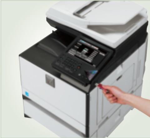
An easily accessible USB connector allows for simplified printing of PDF files from common USB thumb drives.