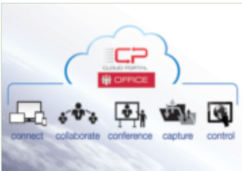
Work more efficiently and collaborate more easily with Sharp Cloud Portal Office.