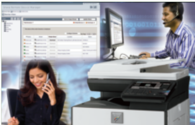
Sharp Remote Device Manager.