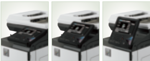
Multi-position tilt screen allows for adjustment to a convenient viewing position.