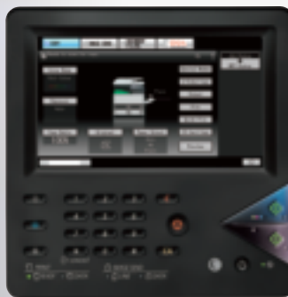
A large, high resolution touch-screen makes it easy to access features.

The compact MX-C301W desktop color workgroup document system has been built on the Sharp OSA® development platform, making integration with network applications and cloud services easier than ever. Sharp's enhanced security platform with standard SSL support, 256-bit data encryption and up to 7 times data overwrite protection helps assure that your intellectual property is well protected.