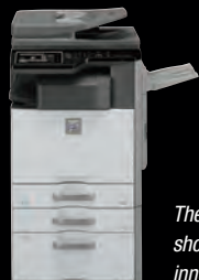
The MX-M564N shown with compact inner finisher.

On-board Document Storage Sharp's easy-to-use document filing system enables users to store frequently used files.