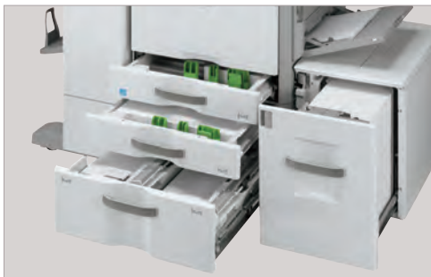
Up to 6,600-sheet paper capacity with available options.