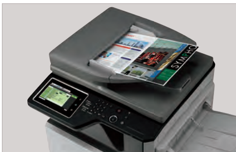
Standard 100-sheet RSPF scans up to 56 images-per-minute.