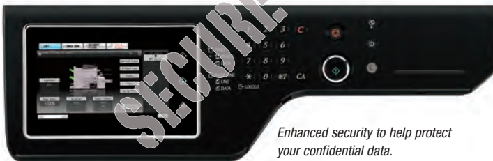
Enhanced security to help protect your confidential data.

The MX-M364N/464N/564N Essentials Series offers several layers of standard security to protect your business and user information . Standard features include data encryption, data overwrite protection, confidential printing and more. And, with Sharp's convenient End-of-Lease feature , all job data and user data can be easily erased at time of trade in.