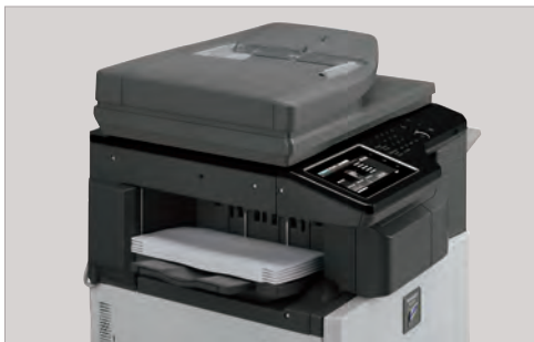
Available compact inner finisher with 50-sheet staple capacity.

A full-featured MFP that is also a strong value – the MX-M364N/M464N/M564N Essentials Series monochrome document systems will exceed your expectations.