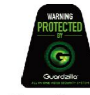
Home Security Sticker