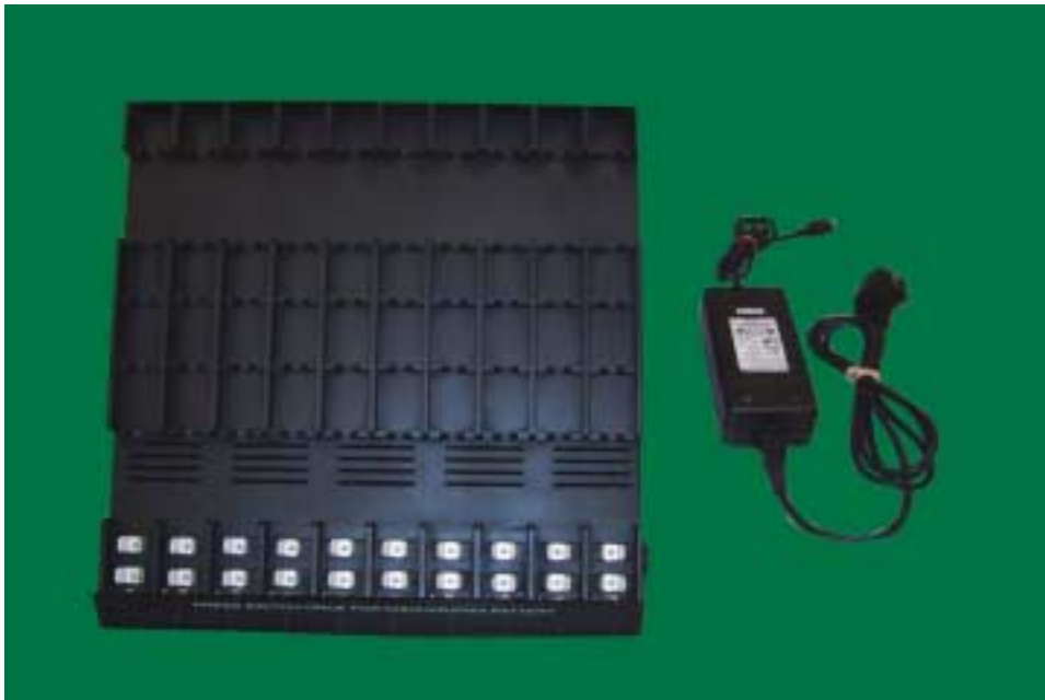
Smartpin gang charger and power supply unit

A discharge button is provided on the gang charger to discharge the battery packs to minimize “memory” effects. Once per week, fully discharge each battery by pushing the discharge button. Discharging time is about six hours. Use care not to bend the packs unnecessarily as the battery tube can be damaged. It is recommended to use two hands to insert and remove the battery. This charger is configured to insert or remove any of the 10 packs being charged independently (without having to remove other packs or covers to gain access, for example).