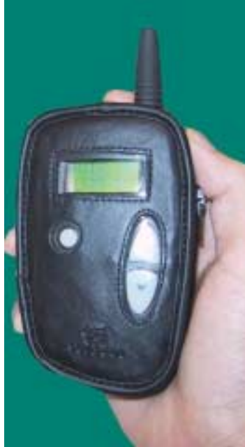
YardDog unit with leather case