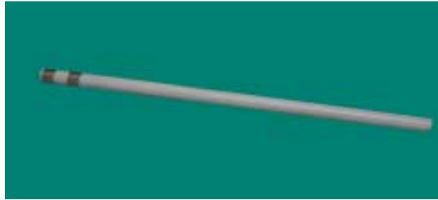
Smartpin battery pack

The battery packs have been specifically designed to fit both the SmartPins and the charger. They consist of a pack of six-nickel-metal-hydride batteries that may be repeatedly charged for the life of your system. The batteries have been shrink-wrapped into a tube that also houses the necessary contacts. This battery pack has a capacity of 4500mAHr and must be carefully handled with care.