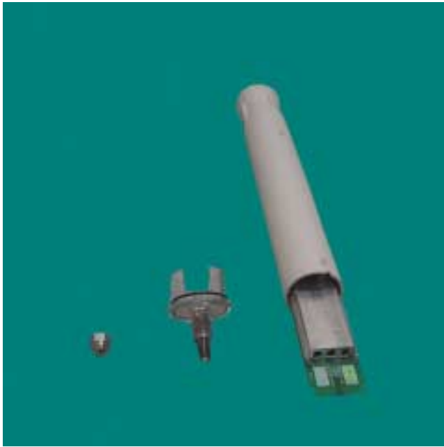
Smartpin mast with top cap removed and the electronics partially out

The mast is the top portion of the SmartPin. The mast houses the electronics of the flagstick. Do not access the electronics inside the mast without good reason. The only reason to access the electronics is to change the pin address, and this is done by removing the top cap. See section on Changing Pin Address for instructions.