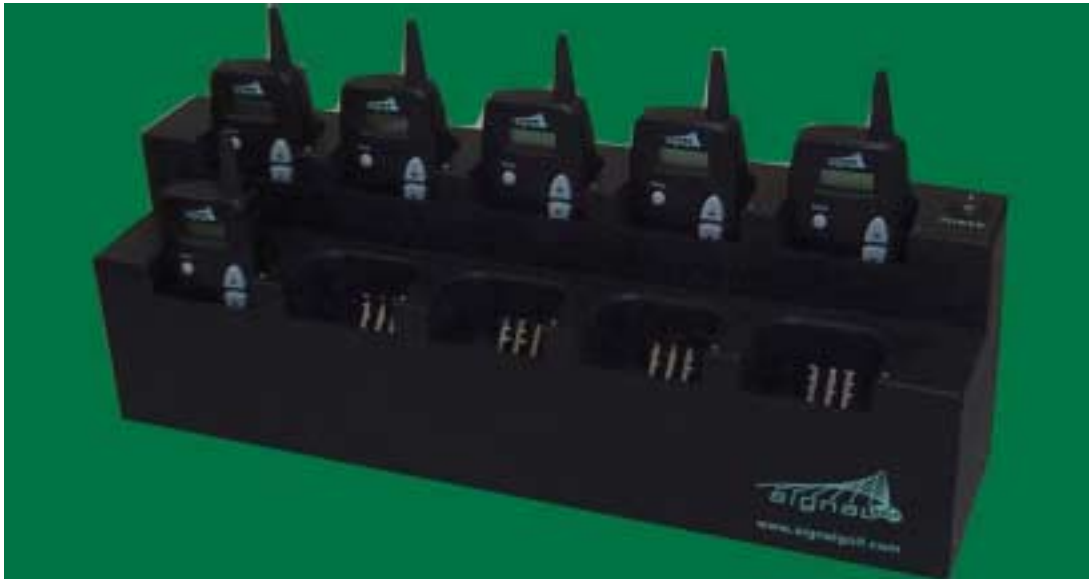
Charging YardDog units