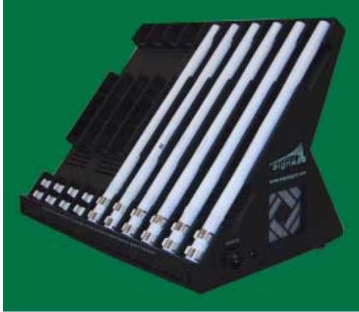
Charging Smartpin battery packs