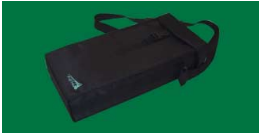
Battery carrier case