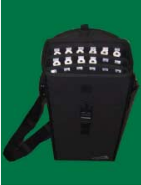
Carrier case with slots for batteries