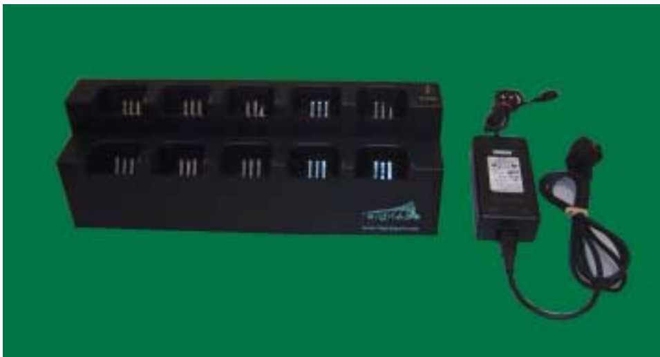
YardDog unit gang charger and power supply unit

YardDog Unit battery packs are mounted inside the Handheld units. This gang charger is designed to charge 10 YardDog units and should be placed on a flat surface and protected from excessive dust, dirt and contaminants. The gang charger also includes 1 (one) desktop power supply that can be plugged into a standard wall outlet. Power supply input voltage is from 100Vac to 240Vac and also employs auto-switching technology. Output voltage rating is 13Vdc \pm 5\% regulation and has a 6.15Amps of current rating. Using then power supply beyond its rating would result in malfunction or damage to the charger.