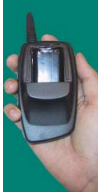
YardDog unit battery pack

YardDog units are the hand held “pager” like units that communicate with the SmartPins to provide the distance in yards or meters to the golfer. Each YardDog comes complete with a leather carrying case. YardDogs are powered by rechargeable batteries. They are recharged by placing the YardDog units in the gang charger.