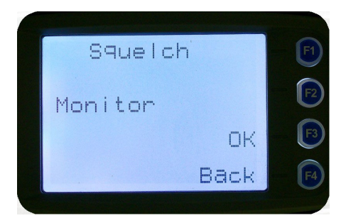
P25 Squelch Screen

Press the " OK " key for the " Squelch " Menu.