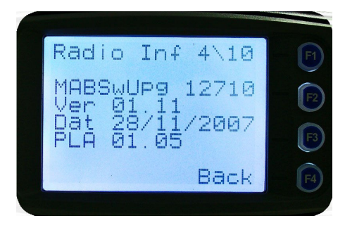
Application Upgrade Version, Date and PLA

Radio Software Version and Serial Number