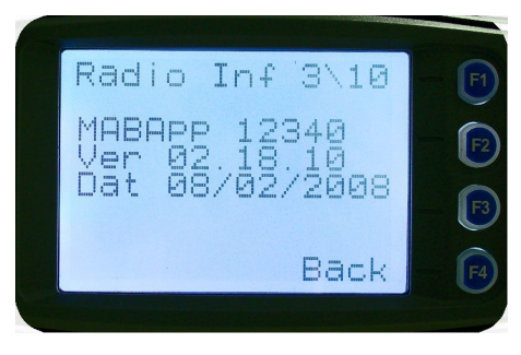
Application Software Version and Date