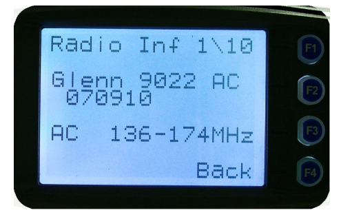
Description, Unit ID and Radio Band

The \blacksquare and \blacktriangle keys select the following information pages: