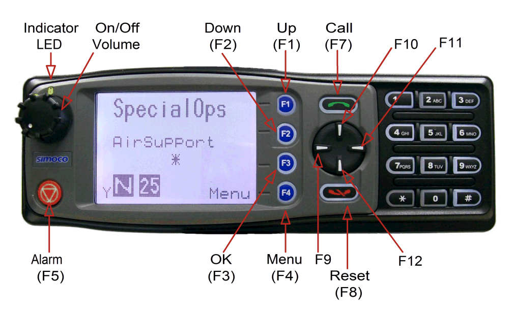
Figure 1 – SDM630 Control Head