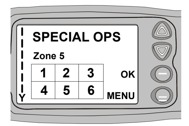
Figure 4 Icon Locations

Radio channels may be configured with the Field Programmer as specific frequencies or as auto scan types. When an auto scan channel is selected, it will immediately go into scan mode. Selecting another non-autoscan channel will stop the scan.