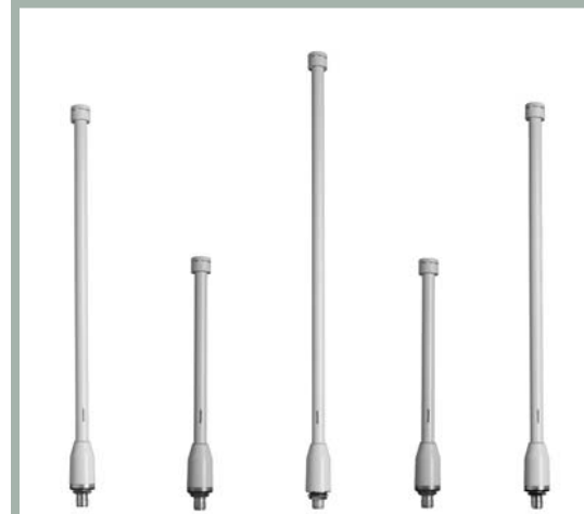
XtremeWave™ Models 25007 (MMDS), MFB58009 (5.8 GHz ISM) and MFB19008A (PCS), MFB24006 and MFB24008 (2.4 GHz ISM) Antennas