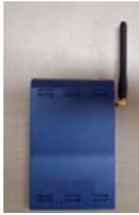
Fig 2-1: CPE appearance